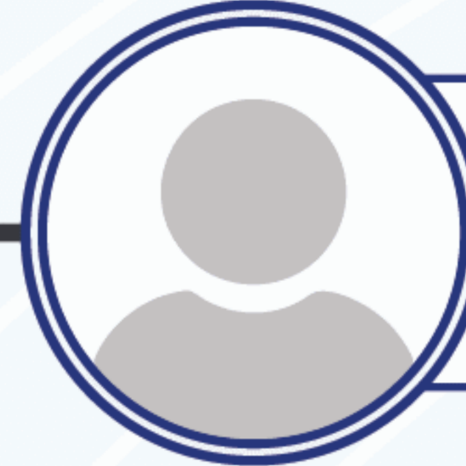
CURRENT POSITION VP OF ENGINEERING & OPERATIONS